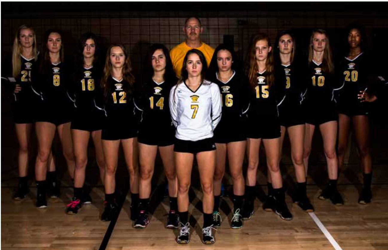
High School Volleyball