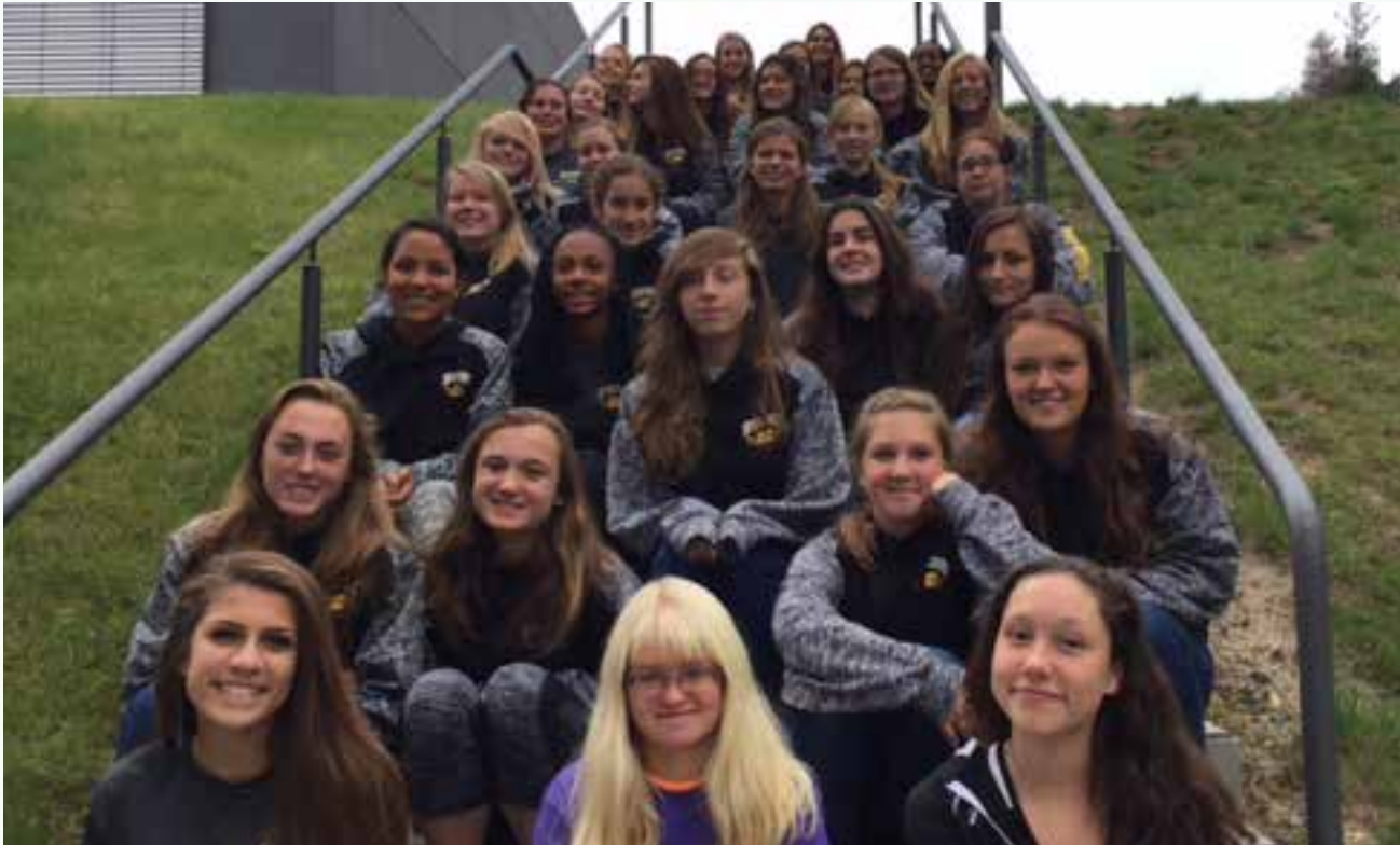
Cross Country Team